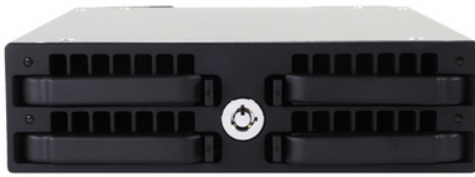
Four-module CRU Qx448 device for standard 5.25" bays, built to withstand tens of thousands of opens