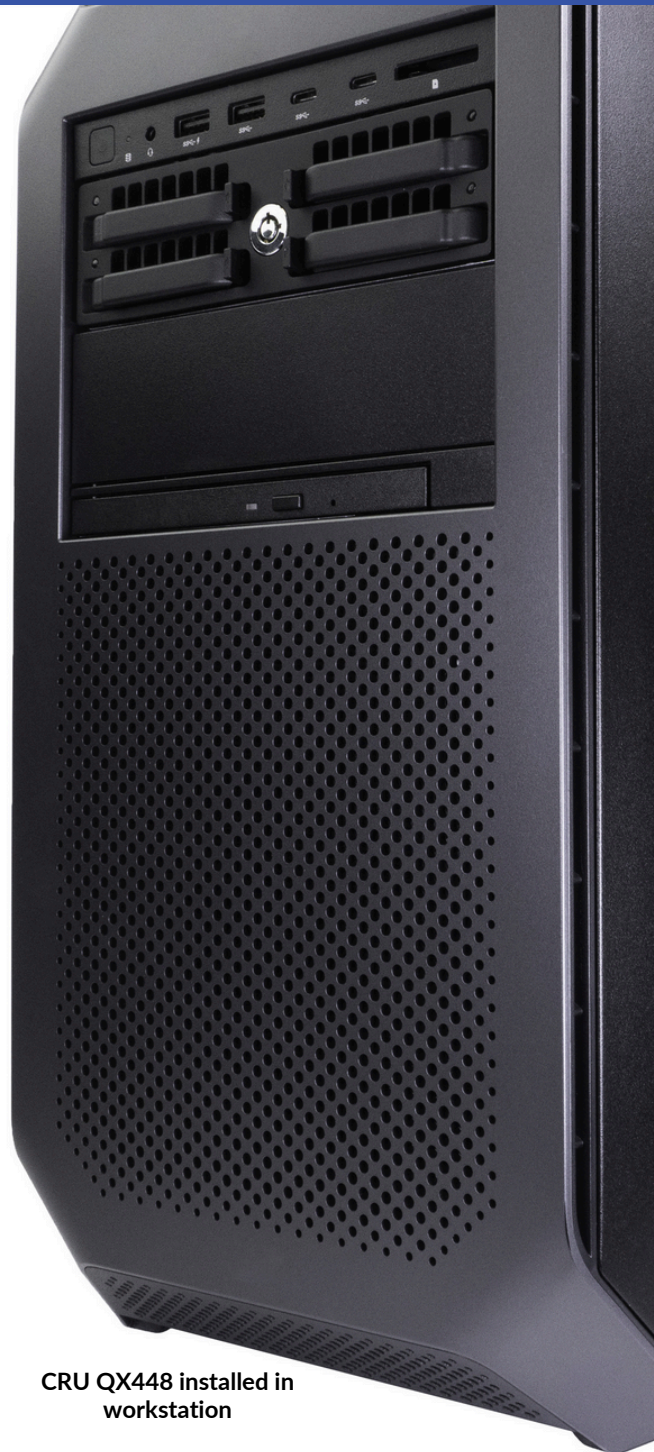
CRU QX448 installed in workstation

A SHIPS-compliant module is interchangeable among a variety of device types, from edge/IoT to desktop to custom systems. CRU will provide engineering details to developers designing custom systems.